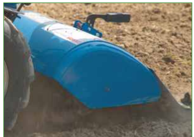
Powerful tines will produce a fine tilth