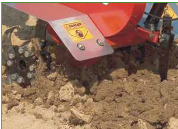
Perfect for garden borders, vegetable plots and allotments